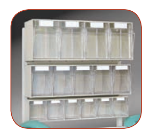
Tilt Bin Organizers