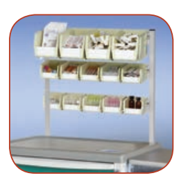
Bridge Storage Bins