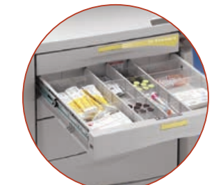
Integral Drawer Dividers offer the flexibility to organize and re-arrange drawer contents

A sturdy work surface offers ample room to efficiently prepare I.V. solutions. Expand your work area with a sizable slide-out work surface, positionable on either the right or left side of the cart.