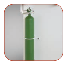
Oxygen Tank Bracket