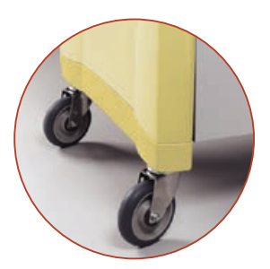
Spread Caster Position provides stability control by moving the wheels out toward the corners of the cart frame