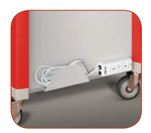
Plug Outlet Strip UL1363A Rated