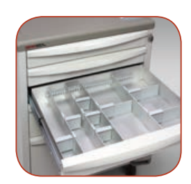
Drawer Flex Divider System