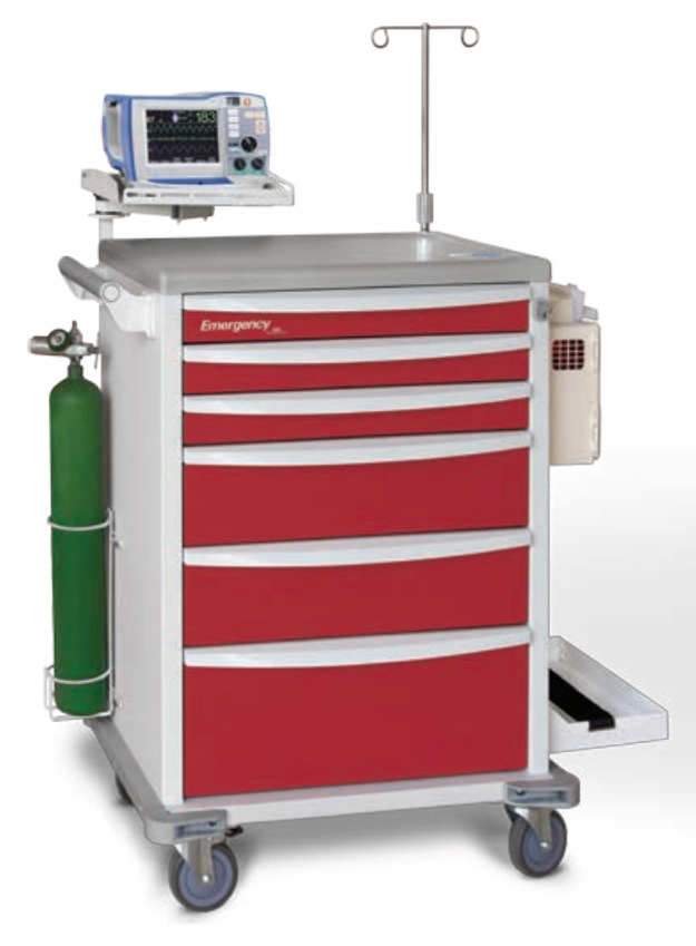
I-Series Emergency Cart with accessories

All I-Series carts are constructed of lightweight aluminum panels, sturdy internal frame, and premium drawer slides to ensure long-term value and durability.