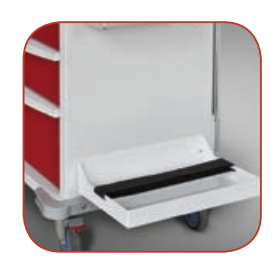
Suction Pump Shelf