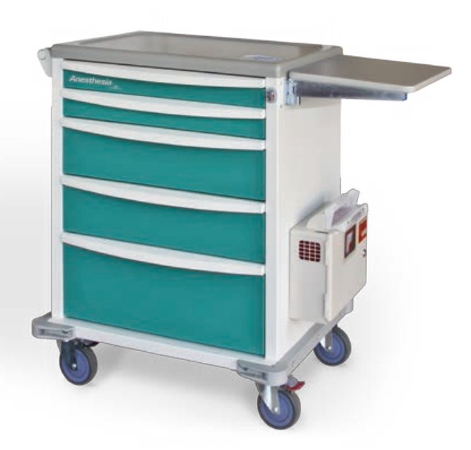
I-Series Anesthesia Cart with accessories