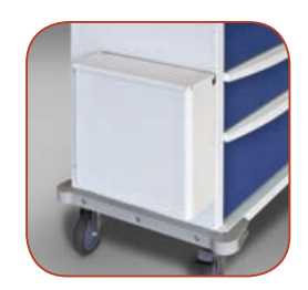
Waste Container w/ Lid