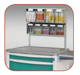
Bridge Tilt Bins