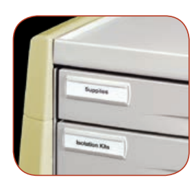
Drawer Tag Holder