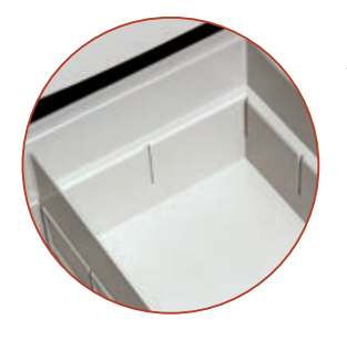
Seamless Drawer Trays are durable and prevent issues associated with pop rivets or sharp edges found in metal drawers

The Avalo Series Procedure Cart offers a wide selection of organization accessories, large capacity, and a choice of models in 4-drawer, 5-drawer, or custom configurations. The Avalo Procedure Cart is adaptable to many different healthcare applications including trauma, airway, dressing, cast, or general supply cart. Ensure security with a choice of three (3) proven lock systems including an advanced keyless entry with auto-relock.