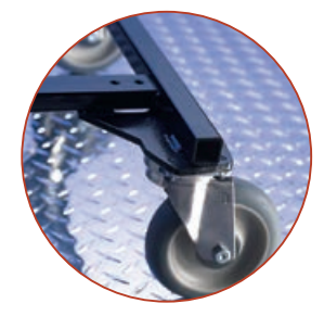
Precision welded all-steel frame is virtually indestructible

Select from an array of drawer divider and tray solutions that offer complete flexibility for organizing supplies in each drawer.