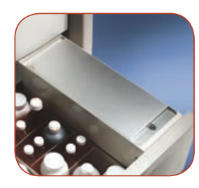
Internal Lock Box