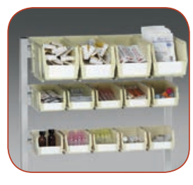
Bulk Storage Bins