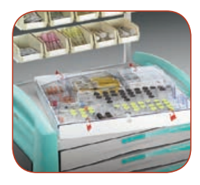
Divided Drawer Tray