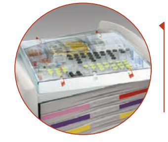
Removable drawer trays promote orderly storage and organization of emergency supplies

Contents are secured with a breakaway locking handle, yet a simple and swift motion can quickly break the tamper-evident seal giving access to all drawers and emergency supplies.