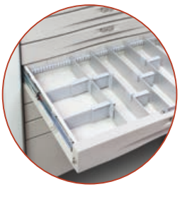
Drawer Flex Dividers