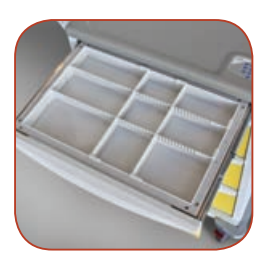
ISO Trays (dividers sold separately)