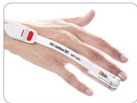
RD rainbow SET Adt finger application