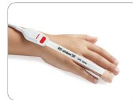
RD rainbow SET Inf finger application