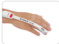
RD rainbow SET Pdt finger application