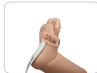
RD rainbow SET Neo neonatal foot application