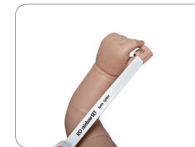
RD rainbow SET Inf thumb application