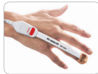
RD rainbow SET Neo adult finger application